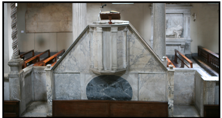
Ambo: San Clemente, Rome

F OR: ARCHITECTS designing churches, F ARTISTS preparing commissions, D IOCESAN personnel responsible, P ASTORS, parish planning, liturgy committees.