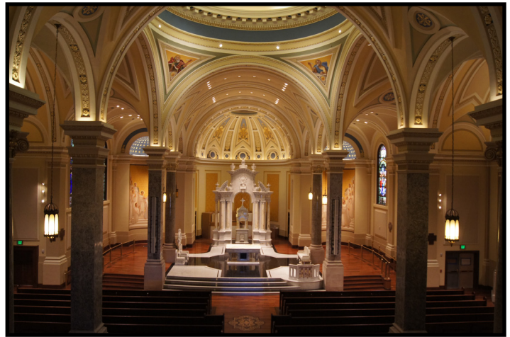
Cathedral of the Immaculate Conception, Wichita

http://architectureforliturgy.com/ liturgy-week-1